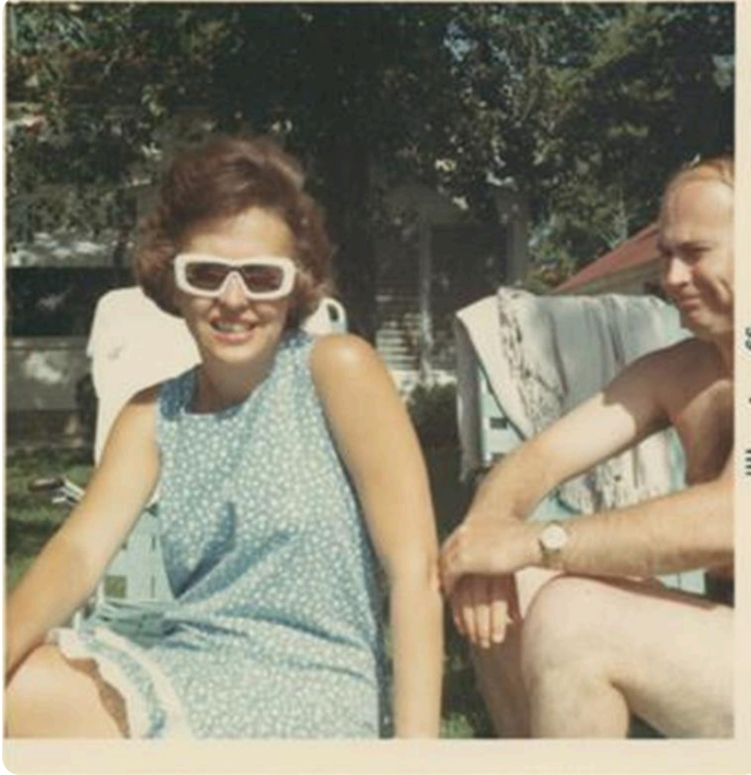
CLARK LAKE, MICHIGAN JULY 1966